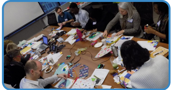
A workshop at the DC-MD-VA SRTS Summit

other – such as conferences and webinars – to create spaces to learn from one another. The Partnership is always thinking about how we can be representative of all communities as we encourage safe and active travel.