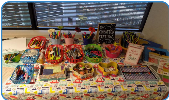
Kori's Creation Station

The Safe Routes Partnership works in many different communities, so we're always trying to learn the mobility needs of different audiences and share those stories with others. We also organize opportunities for people to connect with each